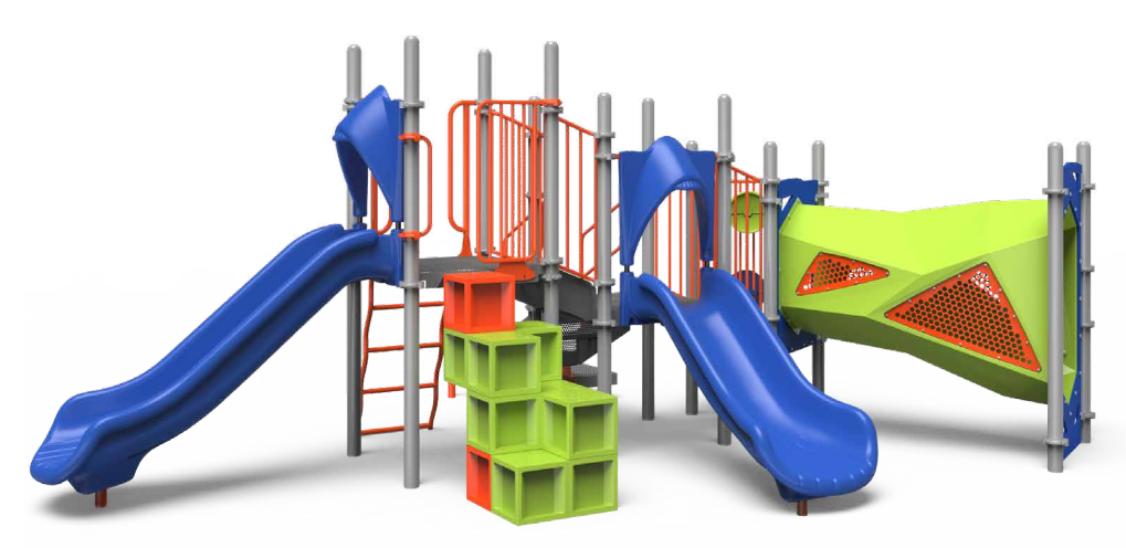
350-2236 • Space Required: 10.31m x 7.92m • Users: 31