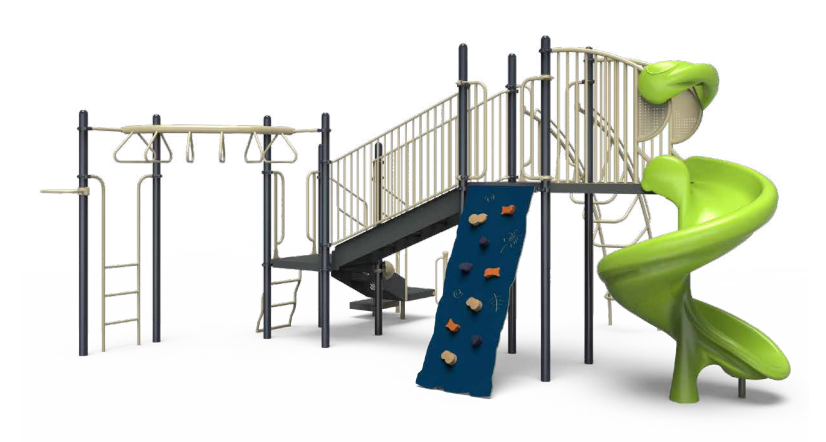
350-1966 • Space Required: 10.67m x 8.99m • Users: 24

350-1715 • Space Required: 9.45m x 8.33m • Users: 24